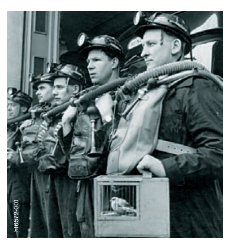
The origins of portable gas detection technology are found in the mining industry. Before the availability of sensors, canaries acted as a warning system for miners. They were used to check for hazardous substances in the mine.

measure the widest variety of gases means that a perfect solution is available for each measurement task. Testing and calibration stations, portable printers and complete workshop solutions ensure that your Dräger gas detection instruments are well maintained and ready for use at a moment's notice.