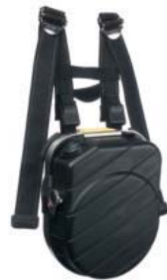
Oxy K 50 S