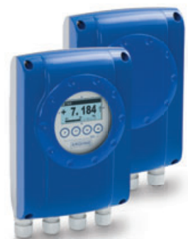
IFC 050 Display version / Blind version

The IFC 050 fulfills all industry specific requirements. Its electronics are protected against condensate with an extra coating, so it can even be used in tropical areas. The housing is protected with dual-layer painting, keeping it safe from aggressive fluids such as salt water. And of course it is very sturdy for outdoor use thanks to its shock resistance!