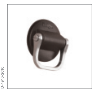
The D-Connect can be used for rescue operations and to attach measuring instruments, tools, etc.