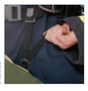
The height adjustment is used to fit the suit to various body heights.