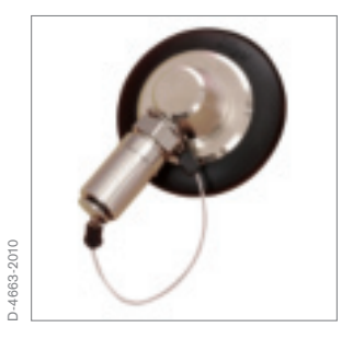
The air-connect is a connection to an external source of breathing air.