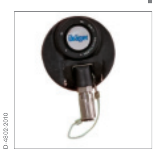
The RV PT 120 L is a connection to an external source of breathing air and features controllable suit cooling.