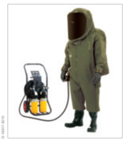
Dräger CPS 7900, olive with Dräger PAS AirPack I

This makes activities carried out in especially warm temperatures, e.g. surveying hazardous areas in hot climates, significantly less stressful for the cardiovascular system of the wearer. In addition, the system can also be used to have a fully equipped rescue team on stand-by without loosing breathing air and with minimized thermal stresses.