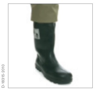
Integrated safety boots facilitate putting the suit on.