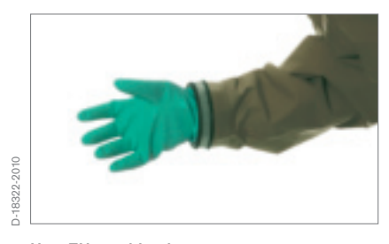
New EN combination