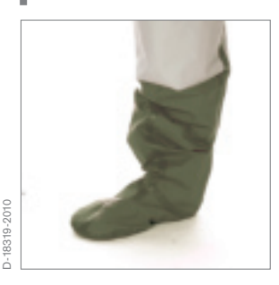
Gas-tight socks offer flexibility when selecting boots.