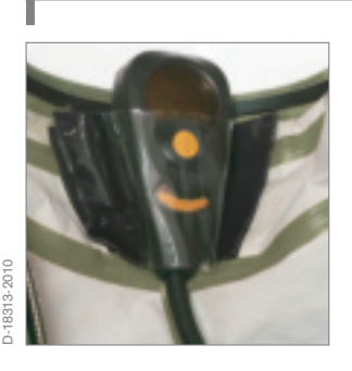
Pressure gauge holder to mount manometer or bodyguard within wearer's field of vision.