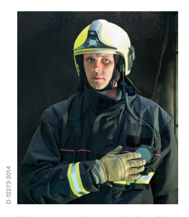
Helmet-mounted communication with robust speech button