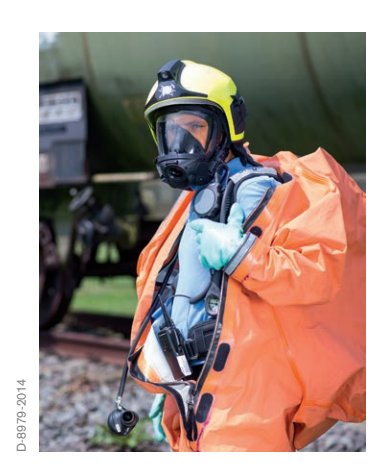
Effective communication in chemical protective suit

Our wide array of products and solutions means that you are sure to find the right communication system for portable transmitter units and protective equipment. This also includes all communication systems for use with breathing masks. The sound of one's own breathing, as well as poor view can greatly impair communication. That is why our microphones are mounted directly on the speech membrane of the mask. This way, each spoken word is clearly transmitted. It has been shown that a clear communication significantly reduces the amount of stress while wearing breathing- or chemical protective suits. The well-established Dräger FPS 7000 and Panorama Nova masks can be outfitted with such a system.