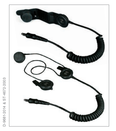
Dräger HC-1/HC-2 COM